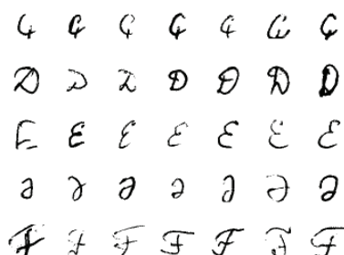
Figure 1. Some characters from training database.

Fuzzy models became one of traditional direction in the recognition theory. In particular, for solving some recognition tasks fuzzy models and fuzzy conclusion are used. Decision-making in pattern recognition problems is carried out by using fuzzy conclusion, rules base of fuzzy production, which is automatically constructed as result of analysis of training samples. Different researchers used similar models in systems for recognition of Chinese, Persian, Arabic, Bulgarian texts and also for recognition of hand-printed digits [1], [2], [3]. In this work were analyzed results of the feed forward neural network with linguistic input variables and fuzzy rules for recognition of Azerbaijani hand-printed characters, written by different writers, in different styles (Fig. 1).