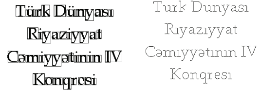
Figure 2. Skeletization of a word combination in Azerbaijani.

For recognition of Azerbaijani characters was constructed hybrid neural network with three layers [12]. Inputs of the network are features, defined after processing and skeletization of given character, in the first layer membership degrees to terms for these features are calculated. Following layer consists of IF-THEN rules for each character. In the last layer is carried out gravity center defuzzification method and defined the number of class, where given character belongs.