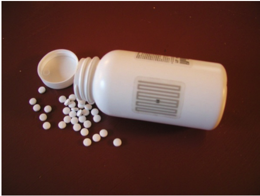
Figure 2. Using RFIDs for medications.