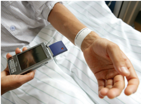
Figure 3 Using RFID straps for patients.