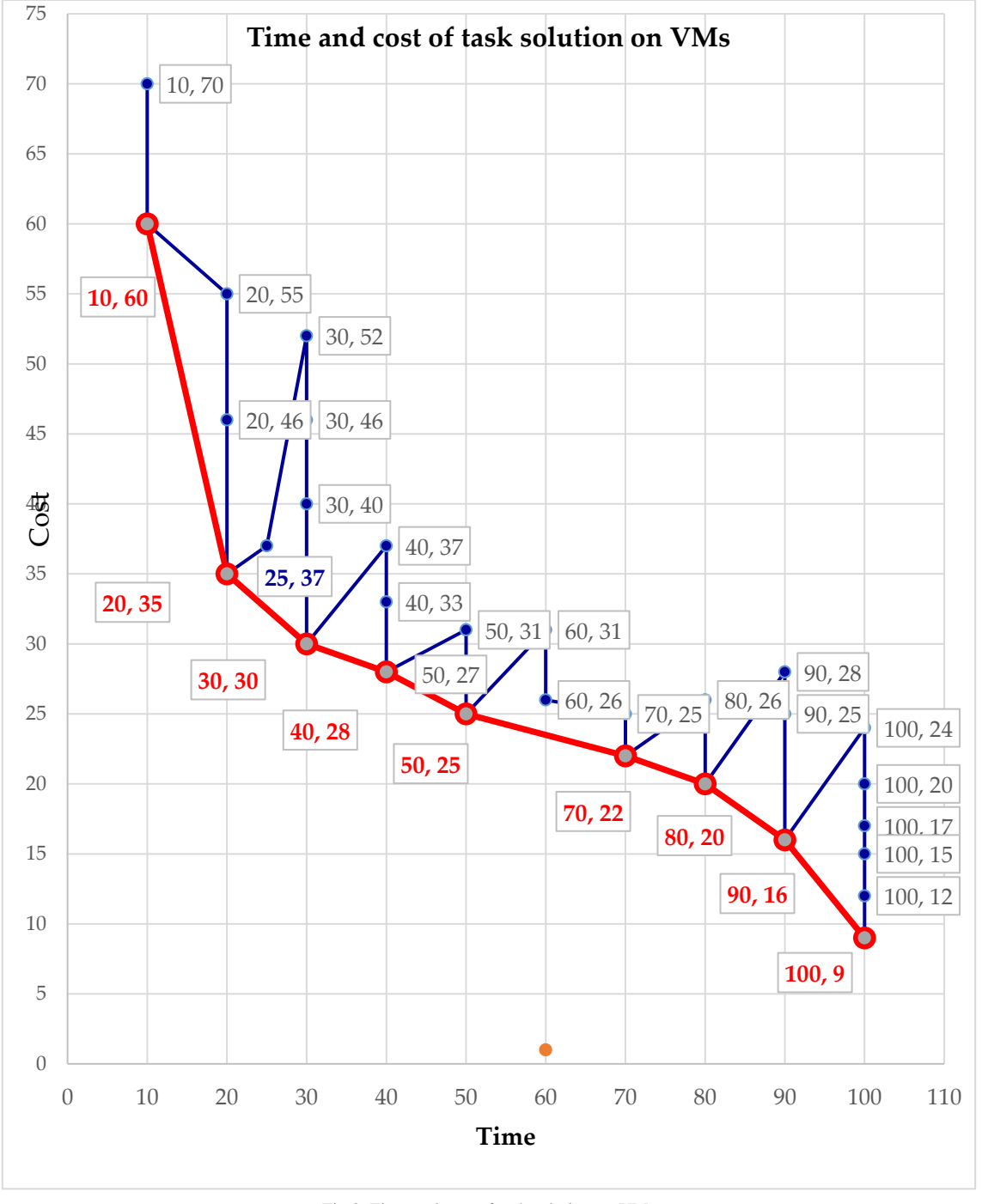
Fig.2. Time and cost of task solution on VMs