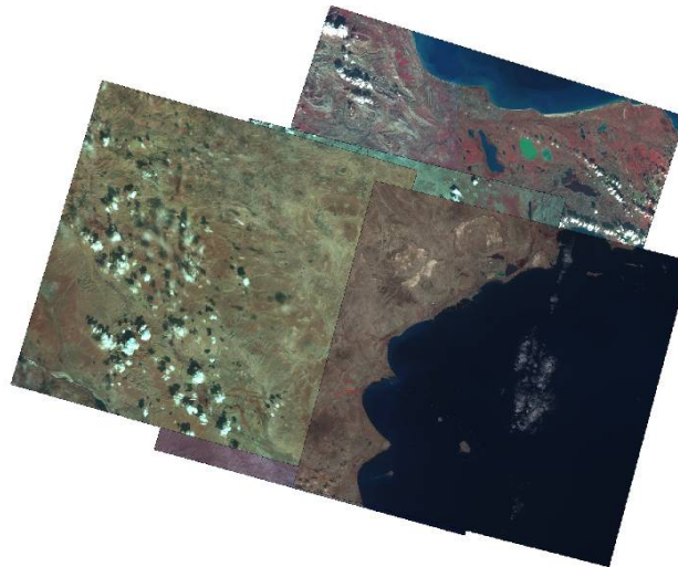
Figure 1. SPOT5 Images

SPOT5 images in 2.5m and 5m resolutions, acquired between 2004 and 2007 were used for the delineation and classification of rare vegetation communities (Figure 1).